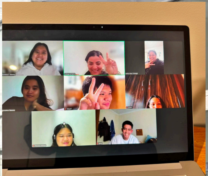
CERTIFICATE IV IN AGEING SUPPORT