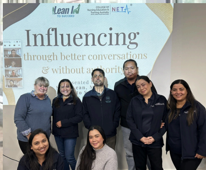
PROFESSIONAL DEVELOPMENT DAY