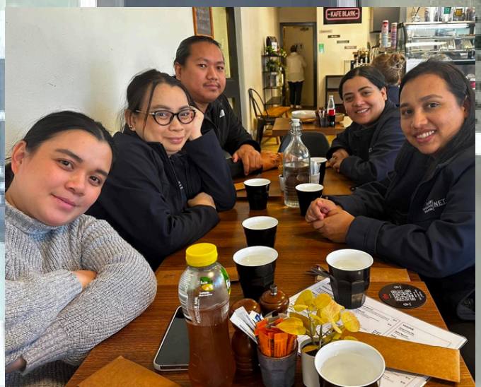
COLLEGE OF NETA 6 TH ANNIVERSARY