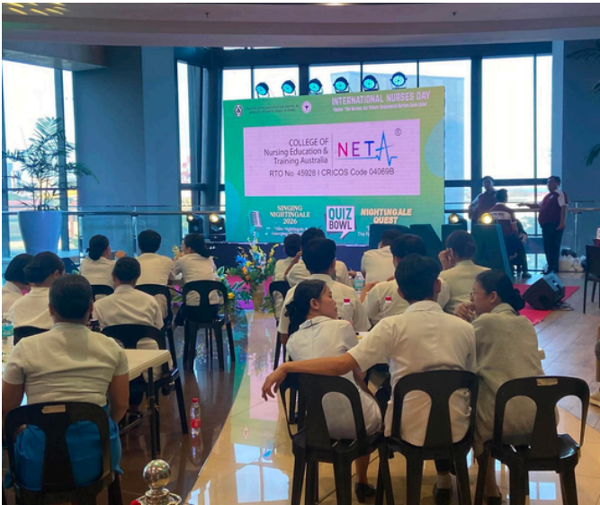
PHILIPPINES: INTERNATIONAL NURSES DAY